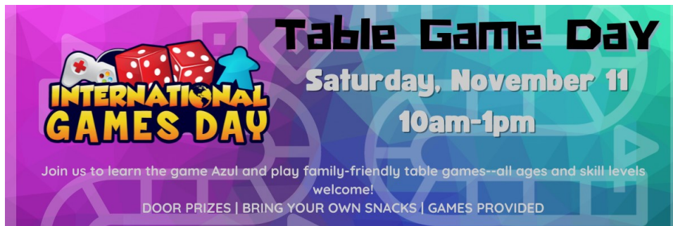
TABLE GAME DAY

RML will join over a thousand libraries around the world during International Games Month as they transform their libraries with play. Like many other libraries across the country and around the world, RML will offer special gaming programs and events suitable for the whole family.