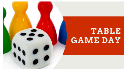
Table Game Day

RML is hosting a table game event on April 5 with games suitable for the whole family.