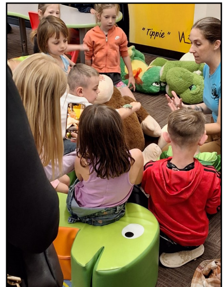
L to R: Butterfly Project; Summer Explorers—International Owl Center; Pinterest Projects; Driftless Center—Frogs