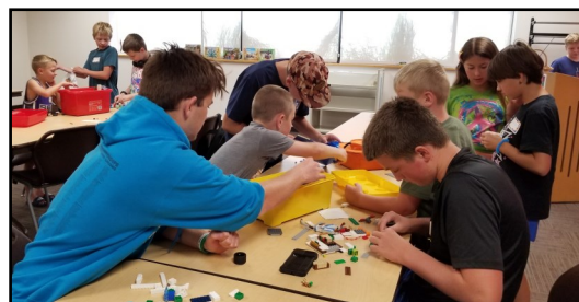
L to R: Lego Club; Summer Explorers—Salt Art Painting